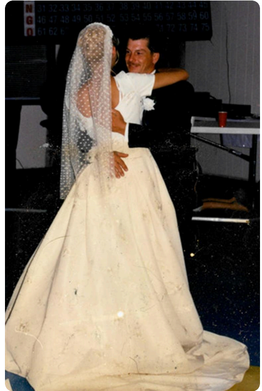
New Photo 1