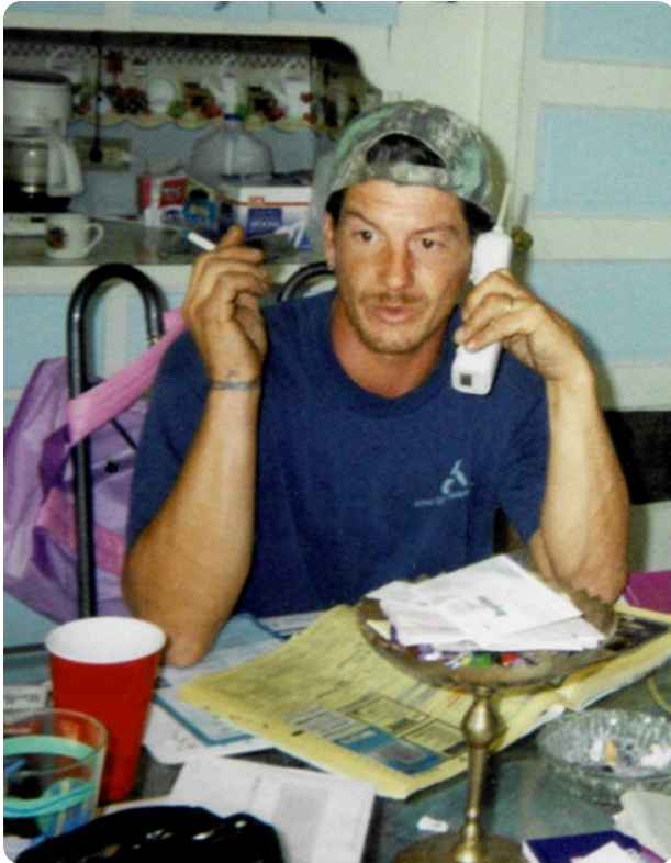
New Photo 1